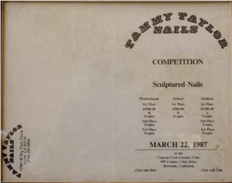
Competition Sheet for Competitor Registration Front