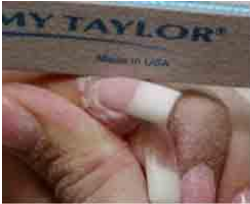
4a Cuticle and Contour area (T.T. Long Lasting Zebra File)

Bevel up one side of the nail, across the top and bevel down the other side, using the exclusive Tammy Taylor "Horseshoe Pattern". Continue the same motion all the way to the free-edge.