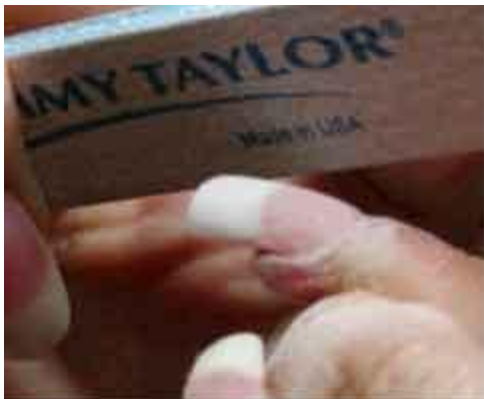
5 Client's Angle (T.T. Long Lasting Zebra file)

9-4b Road- File around cuticle area making sure there is a little road between the acrylic and the cuticle.