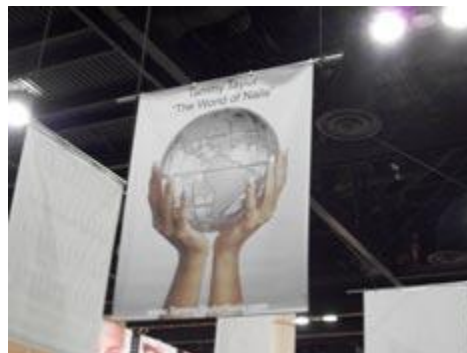
"The Tammy Taylor World of Nails"

Romans 12:18 If it is possible, as far as it depends on you, live at peace with everyone.