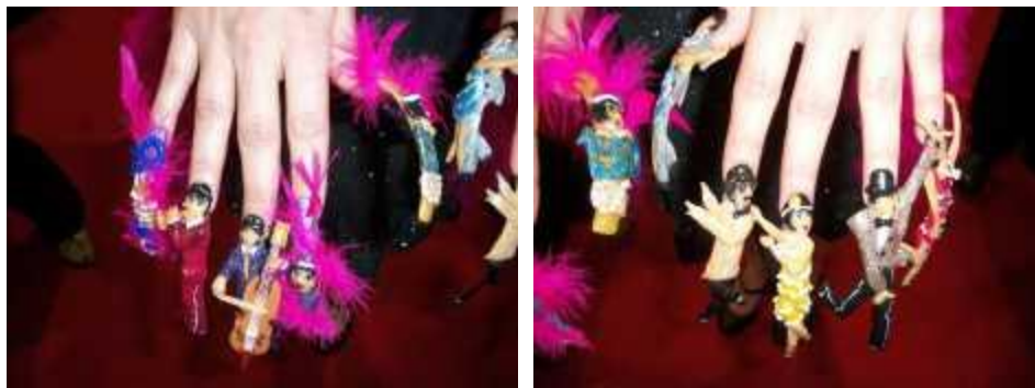
Our Tammy Taylor Nail Techs from Greece, Nail Art with Prizma