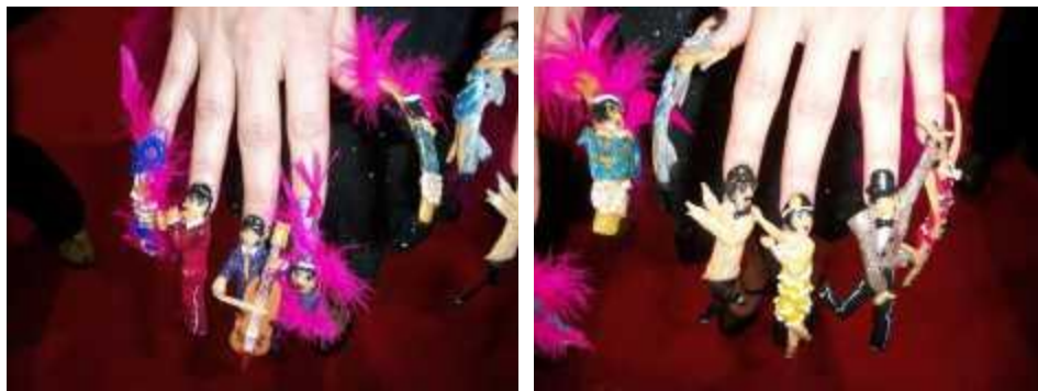
Our Tammy Taylor Nail Techs from Greece, Nail Art with Prizma