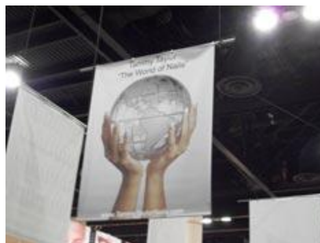
"The Tammy Taylor World of Nails"

Romans 12:18 If it is possible, as far as it depends on you, live at peace with everyone.