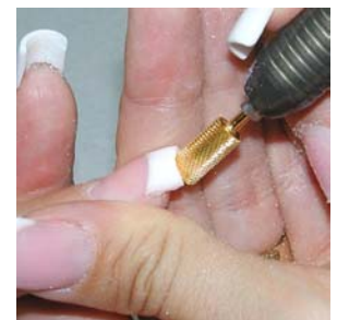
Thin out, and re-shape C-Curve.