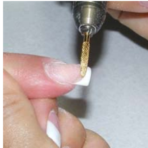
B. Also to clean underneath, in areas close to skin. The medium grit can be used for acrylics and tips. The coarse is for acrylics only.