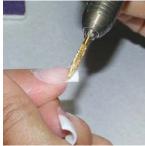
A. Use for Pink & White backfills, to drill out Smile line.