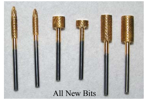
All New Bits